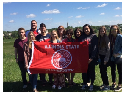
KNR students in Suzal