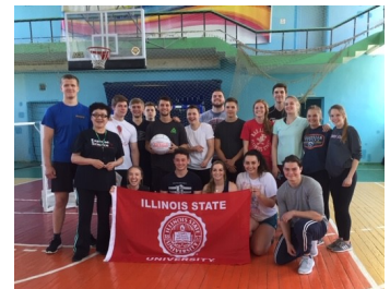
KNR students at Vladimir State University