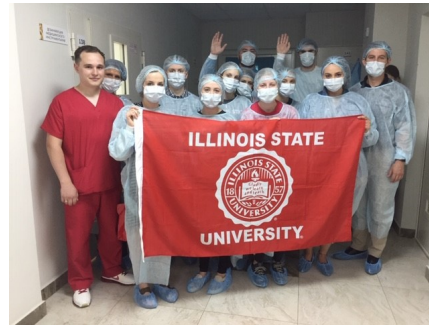
KNR students at Oncology Center

Following the wonderful experience in Vladimir, we traveled to Moscow for two and a half days before flying home. We walked on Red Square, toured the Kremlin, and just toured the city of Moscow! We had incredible learning and sharing of knowledge and experiences; and are looking forward to our next exchange.