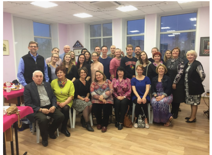
Vladimir Sister Cities Association